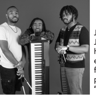
Educated Guess Oct. 24, 2pm